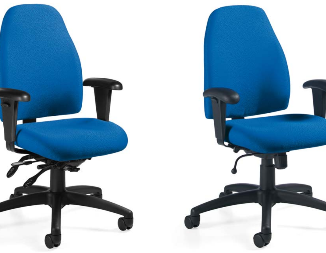
4408 Low Back Synchro-tilter with optional height / width adjustable TD arm

The OBUSFORME® backrest support system has received an extraordinary level of support from the chiropractic community. It is the only such product endorsed by the Canadian Chiropractic Association, the Chiropractic College of Radiologists and Québec Association of Chiropractors. Endorsements have also been received from the Canadian Physiotherapy Association and the Back Association of Canada.